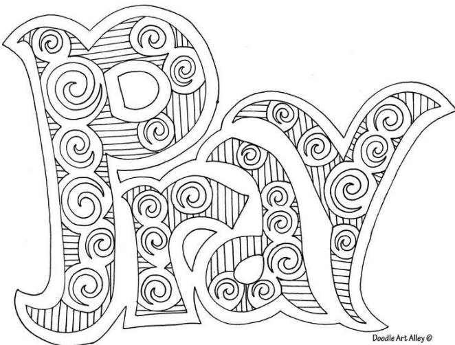
Doodle Art Alley ©